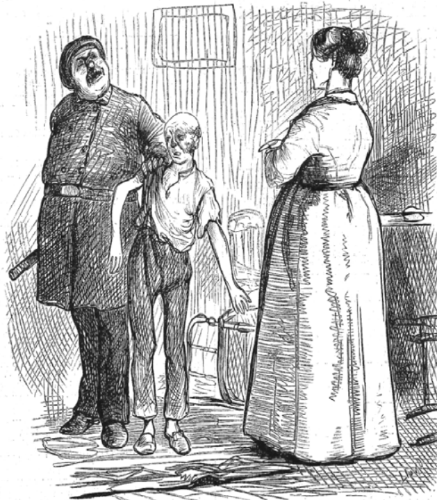
WOMAN'S RIGHTS. POLICEMAN. "I will take him to the polls, Madam, and see that he votes as you dictate."